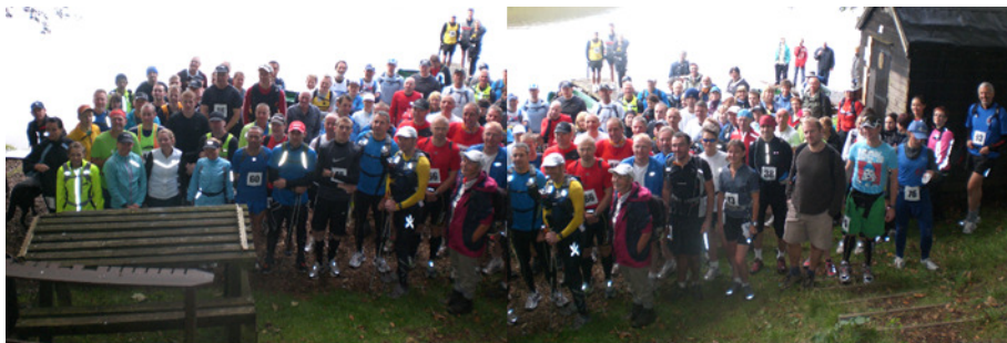
Photo before the start