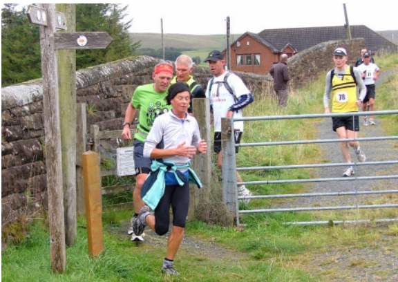
Leg: 5miles in 38mins 13secs (8.36pace)