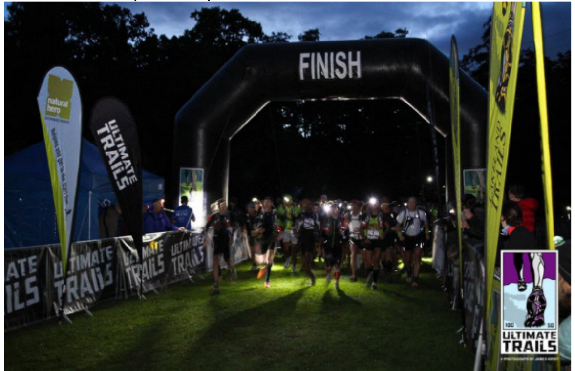
Even though it says finish it was the start!!

I was setting off with a rough sub 15hr plan. I say rough as it was hard to know what a good time for me would be. I've done the race before and because it's a new race no-one has so there are no results to compare things with. On my recce we stopped a lot to video and enjoy the views but I felt 15hrs was a good target to have in mind.