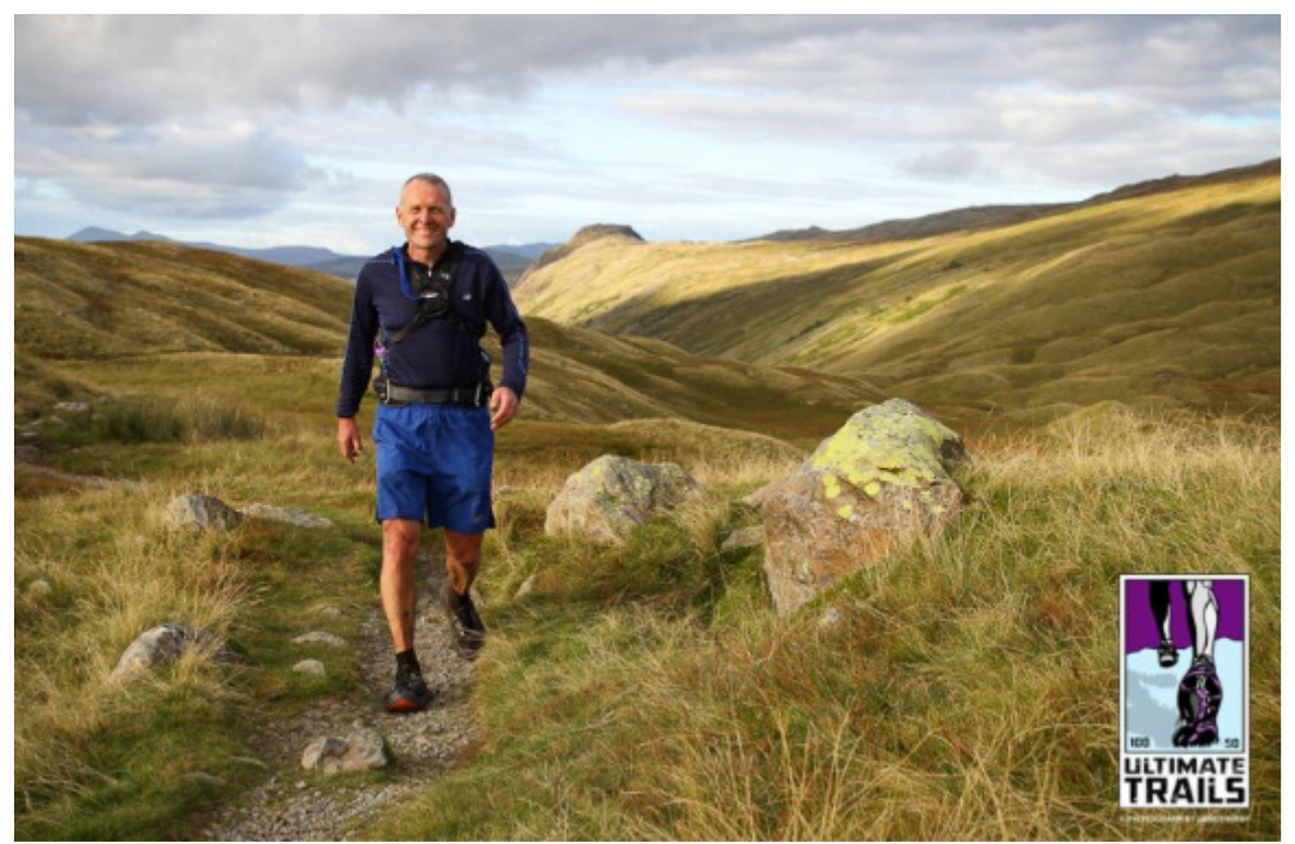
At the top of Stake Pass

I knew there was almost 5miles to the checkpoint at Stickle Barn but most of it was downhill or flat so I was keen to run down as hard as I could. My quads were feeling really good and I was thankful for all those runs down Ben Lomond as they were now paying off big time.