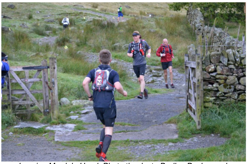
Leaving Mardale Head.